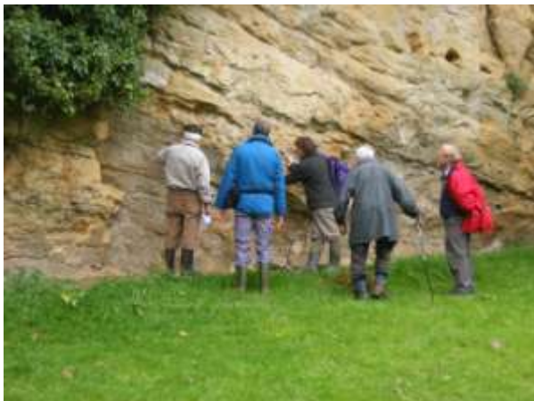
Looking at a limestone quarry

The visit to the site was made with the kind permission of the local farmer who accompanied the group and was able to supply much information to supplement Tony Benfield's observations.