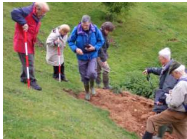
Examining a sand quarry